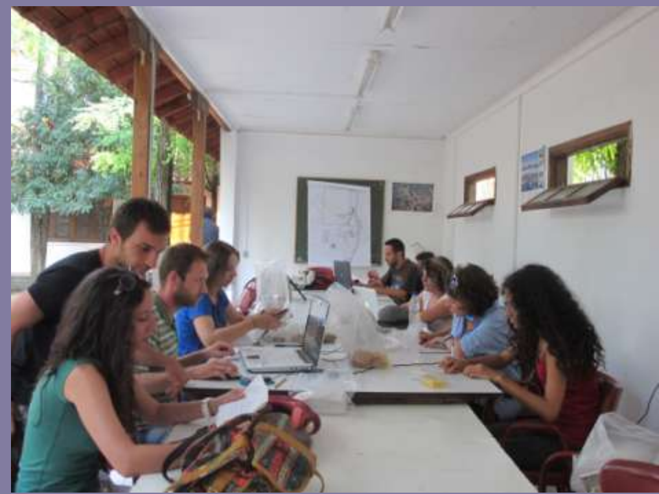
Excavation diary course in Dion